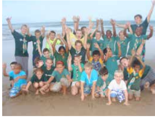
4th Durban Cubs - having a fun pack meeting on the beach is just so cool.